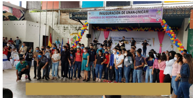
NUEVOS ESTUDIANTES DE UNICAM

As in all years, we have continued to work on a number of projects from prior years as projects often take many years to complete. One of these was the development of a rural satellite university by the Medical Sciences Faculty in UNAN Managua to train medical students, dentists and optometrists locally in northern Nicaragua . This has just been implemented and a picture of the initial group of students is attached. This amazing project will, in addition to training the health care professionals and the new faculty who will sustain the program long-term, ensure that approximately 300,000 people will have improved local access to health care. The model is being planned for four more similar satellite universities in underserved areas of Nicaragua so